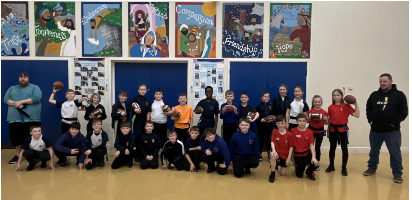
Thursday 15 th February 2024: ATSA Flag American Football Taster Session