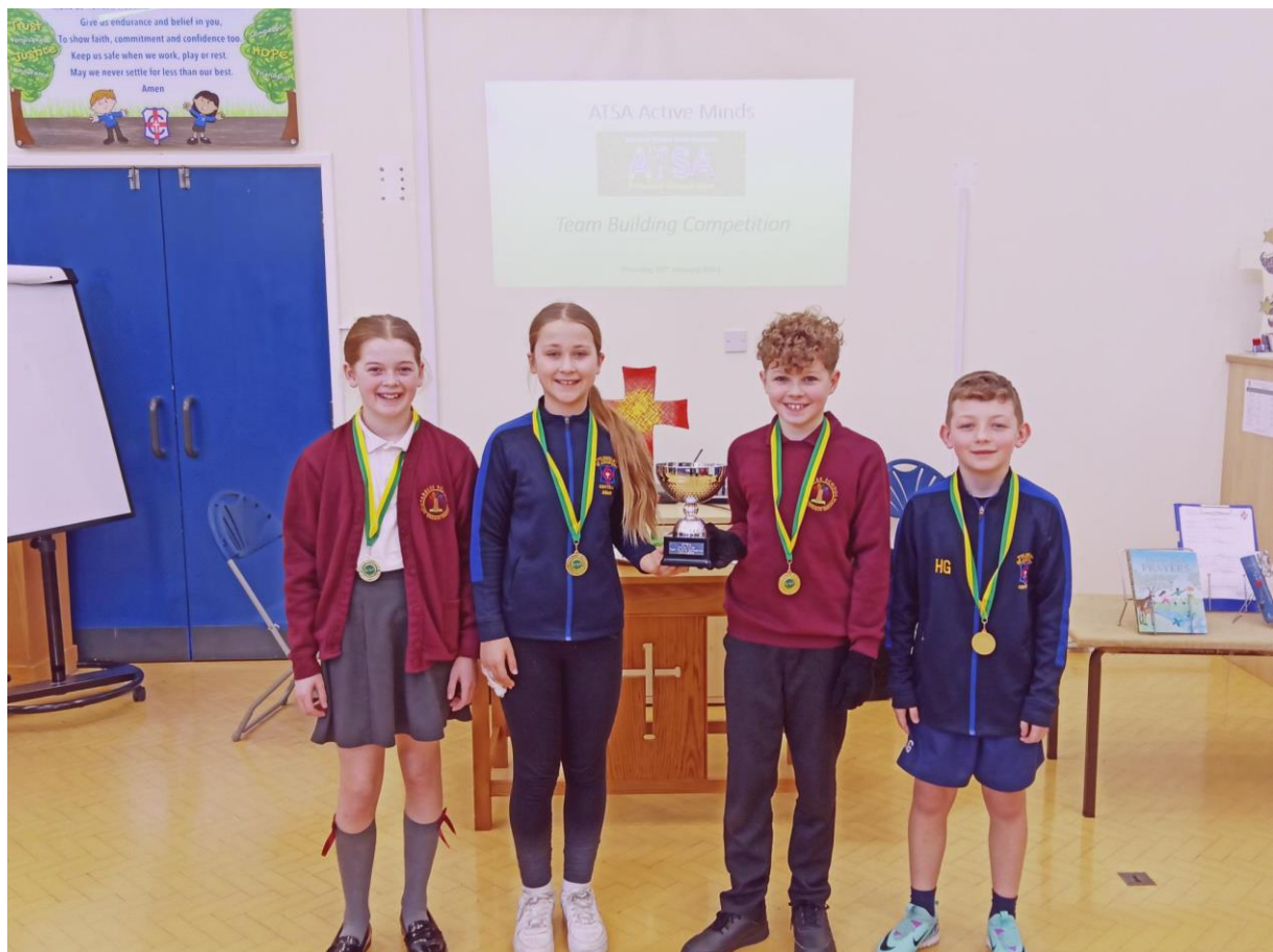
Thursday 25 th January 2024: Winners of the ATSA 'Active Minds' Team Building Competition: St. George's Central and Parklee