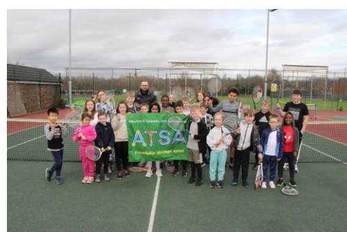
Tuesday 20 th February 2024: ATSA All Sports Holiday Provision: Wigan Athletic Community Trust and Sphairistrike Tennis