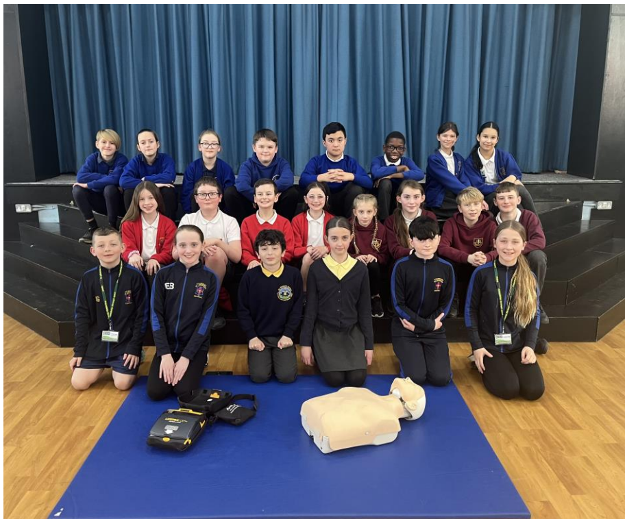
Tuesday 5 th March 2024 ATSA First Aid for Sport