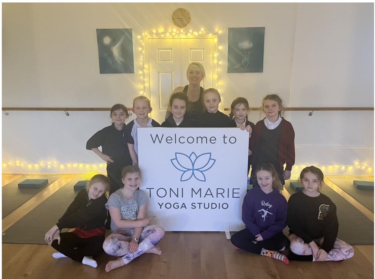
Wednesday 24 th January 2024: ATSA Year 3/4 Yoga Taster Session