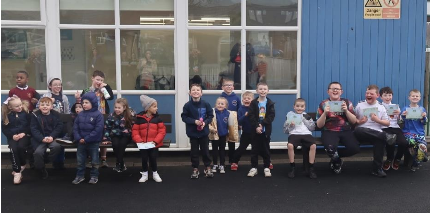
Thursday 7 th March 2024: ATSA 'Access to Success' Football Taster Session