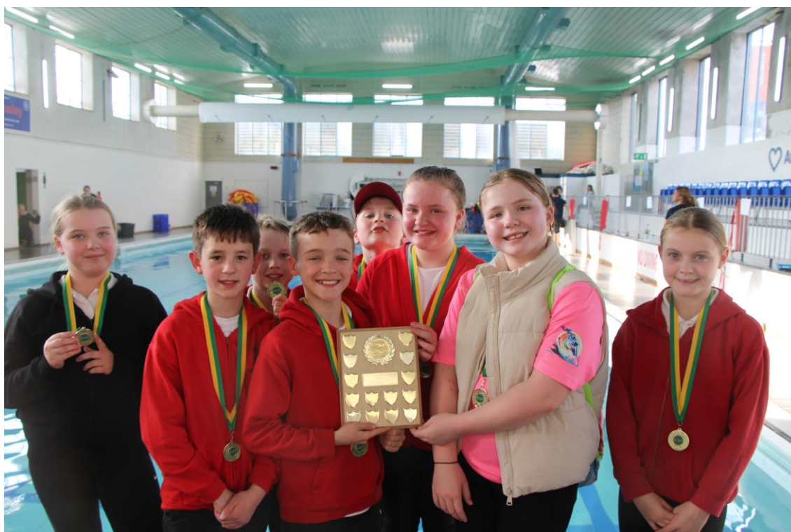
Wednesday 6 th March 2024: Winners of the ATSA KS2 Swimming Gala: St. Benedict's