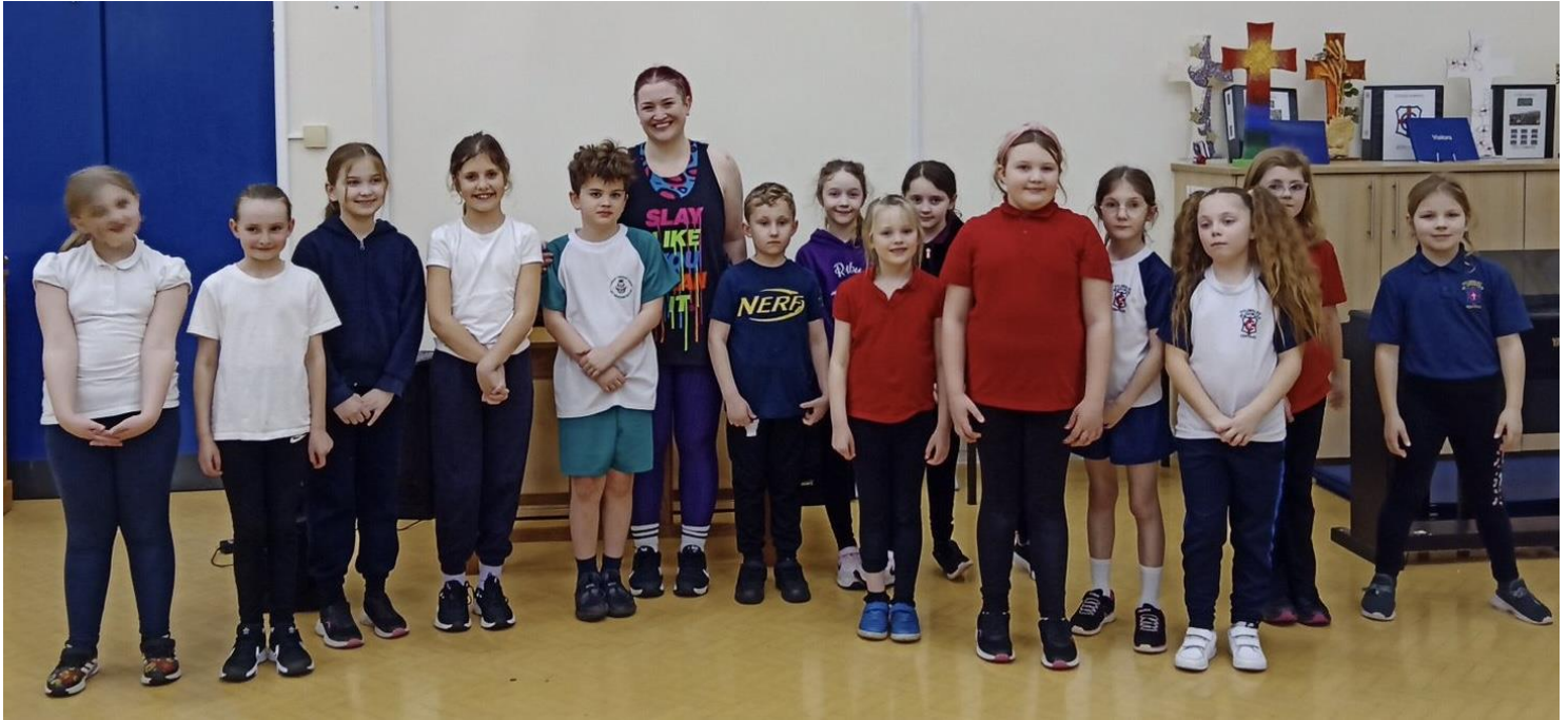
Wednesday 14 th February 2024: ATSA Year 3/4 Zumba Taster Session