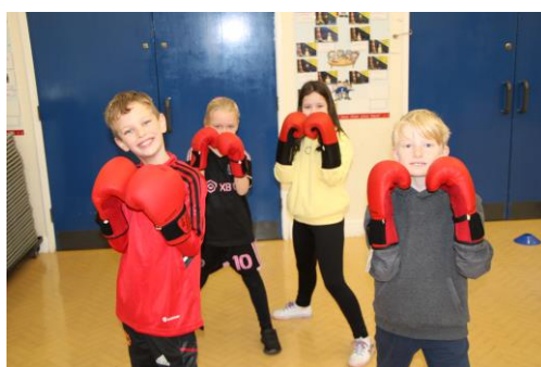
Monday 19 th February 2024: ATSA All Sports Holiday Provision: Boxing for Better