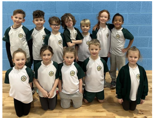
Friday 12 th January 2024: ATSA KS1 Sportshall Athletics