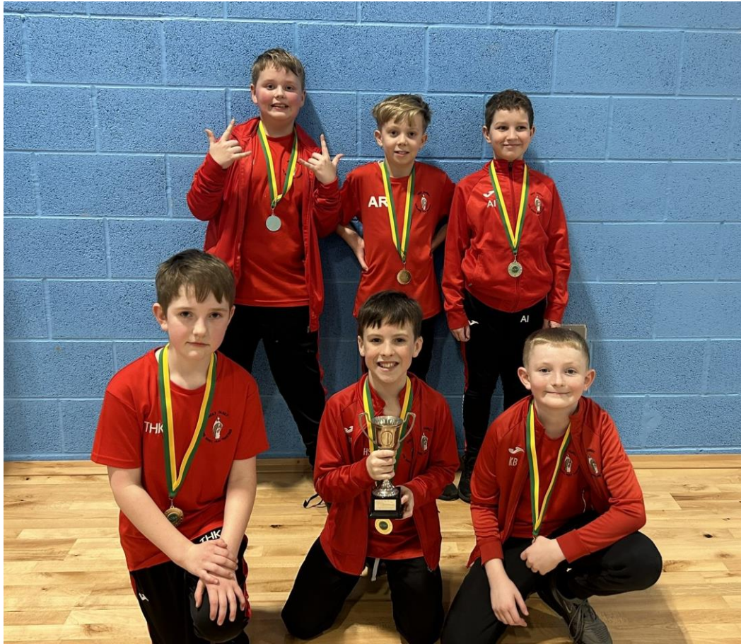
Monday 22 nd January 2024: Winners of the ATSA Dodgeball Competition: Holy Family