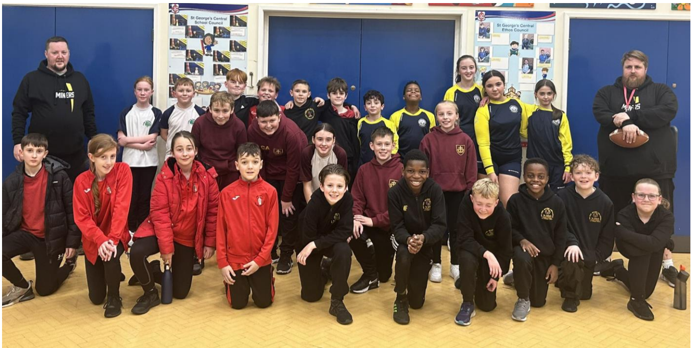
Thursday 8 th February 2024: ATSA Flag American Football Taster Session