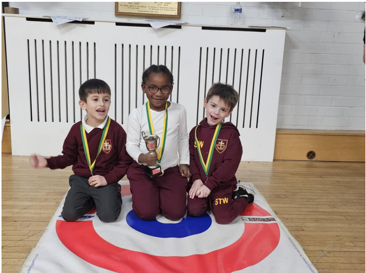
Thursday 1 st February 2024: Winners of the ATSA KS1 Kurling Competition: Sacred Heart