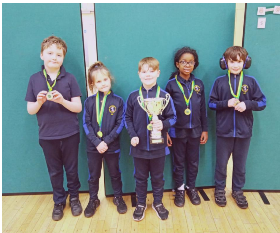
Thursday 11 th January 2024: Winners of the ATSA 'Access to Success' Boccia Competition: Meadowbank