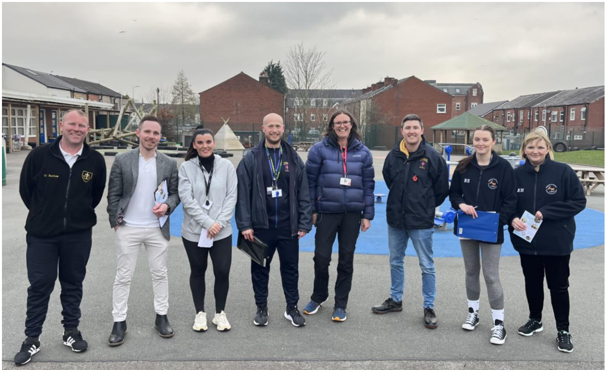
Thursday 7 th March 2024: Orienteering Staff training session