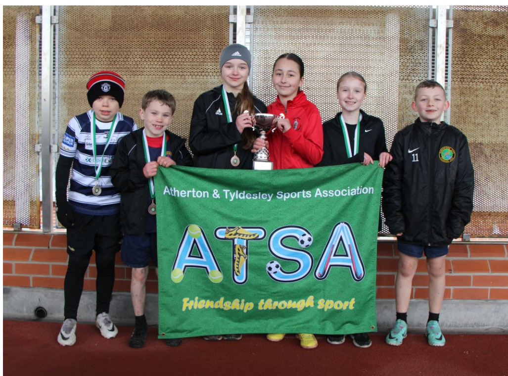
Saturday 2 nd March 2024 Overall Winners of The Graham Jackett Cross Country Event: ATSA