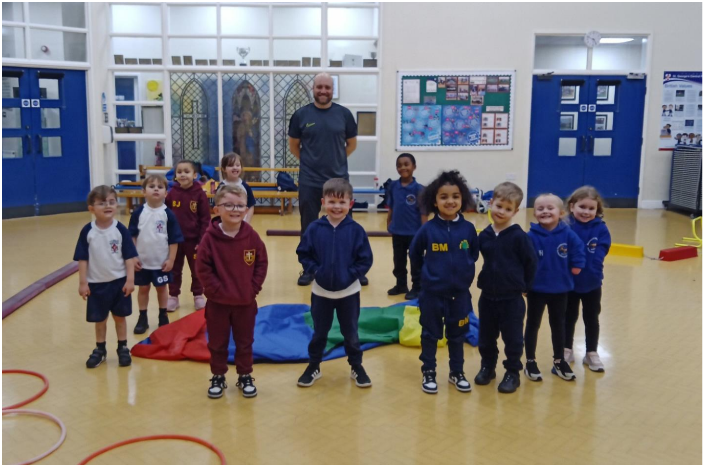
Monday 29 th January 2024: ATSA Kickstarters Taster Session